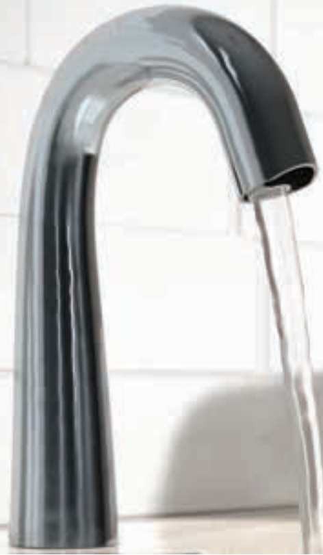
EQ Series High Arc Spout