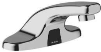
ETF-600 Low-height, hardwired EBF-650 Low-height, battery