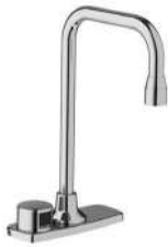
EBF-775 Deck Mount, battery ETF-770 Deck Mount, hardwired